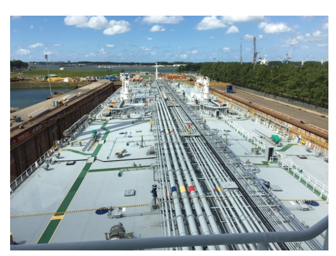
DAMEN VEROLME ROTTERDAM