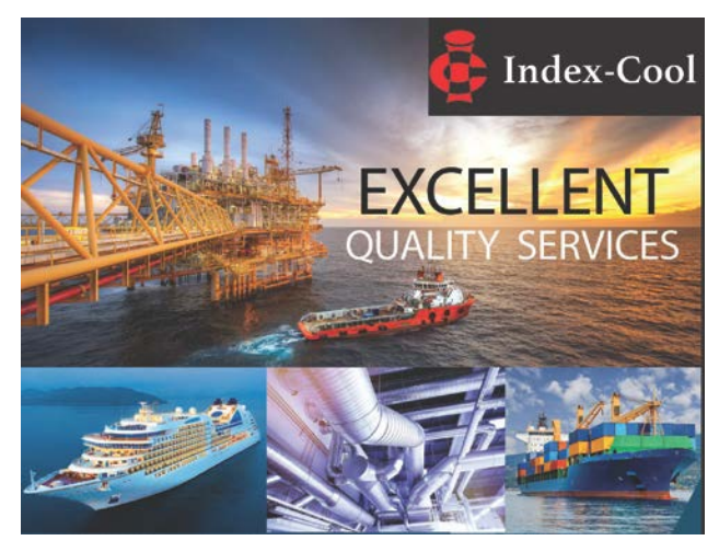
INDEX-COOL MARINE & INDUSTRY